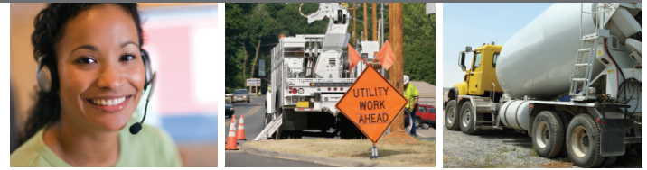
SimpleTrack is ideal for utilities, delivery firms, taxi services, and more!